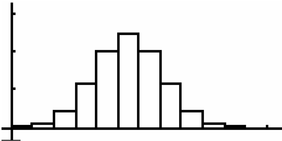
X suit la loi Binomiale B(10 ;0,5)