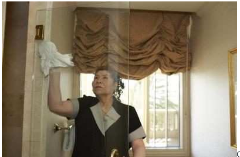
Cleaning the mirror in the

The guest room bathroom gets some much-deserved attention. After each guest checks out of the room, the housekeeper will thoroughly clean the toilet, sink, bathing area and floor of the bathroom with industrial cleaner. The guest bathroom is particularly important as this is the area often filled with germs. There should not be a single inch left untouched in the bathroom, including the walls.