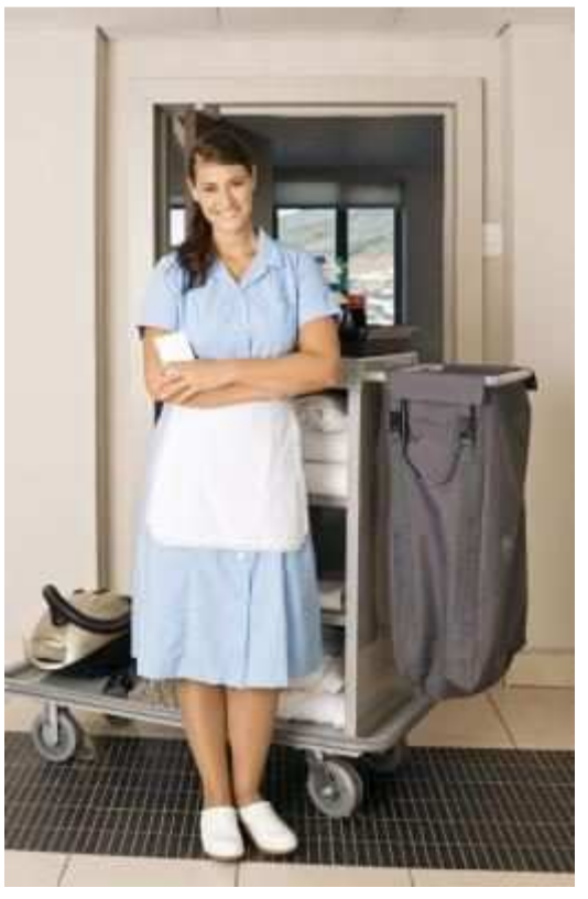
The housekeeper must empty the garbage cans. Making the Beds

Every hotel room has at least one garbage can in the room. The housekeeper will have to empty the garbage can(s) in the room and replace the can liners with fresh, unused liners. Before emptying the room trash, the housekeeper will generally clean up any garbage lying around the room, such as tissues, candy wrappers or other trash items the guest may have left in the room.