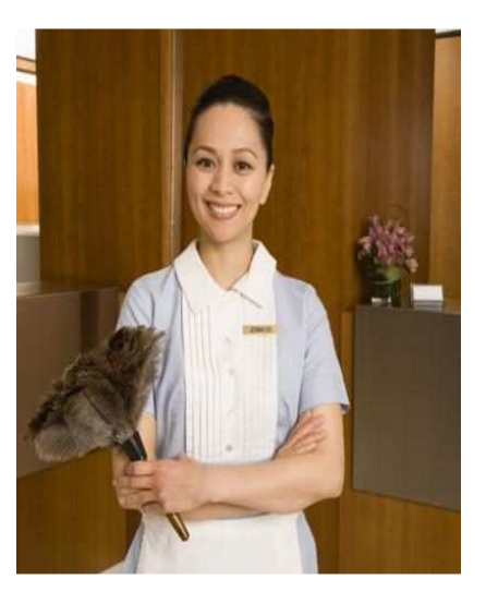
Each room needs to be dusted. Finishing Touches

The room itself will receive a complete dusting from the furniture to the lamp shades. Each item-including lamps, TV, phone and alarm clock among others--is checked to be sure it is in proper working order. Amenities such as soap, shampoo and coffee are restocked throughout the room.