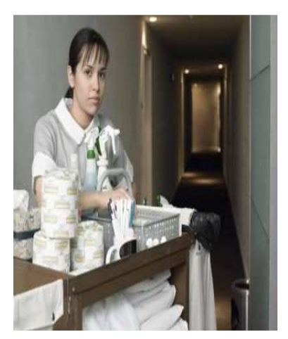
Housekeeper cart Stripping the Room

At the beginning of each workday, a hotel housekeeper will refill her wheeled cart with fresh bath towels, hand towels, wash cloths, fitted sheets, flat sheets, pillow cases and any other linens required in each room. She will also refill her cleaning supplies as well as her stock of coffee and other amenities that are often left in guest rooms.