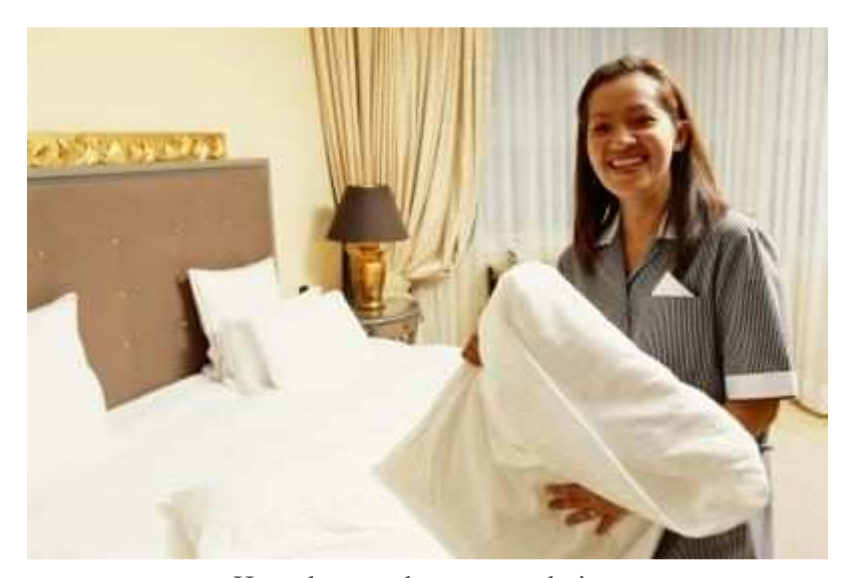
Housekeepers have many duties. Starting the Workday

The duties of a hotel housekeeper are probably the most important duties that take place in a hotel on a daily basis. If the housekeeper has not done her job to expectations, the hotel could lose business. Hotel guests expect their rooms to be cleaned with the utmost accuracy and attention to detail. The cleanliness of a hotel is the key selling factor.