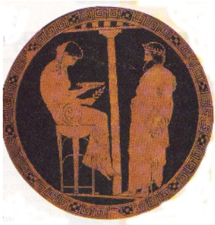
La pythie de Delphes

Politique extérieure : CONSEILS DE L'ORACLE SUR LA GUERRE