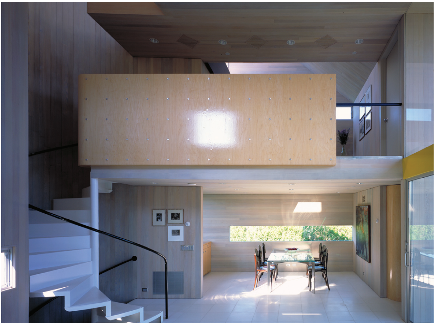
Dining and balcony from living