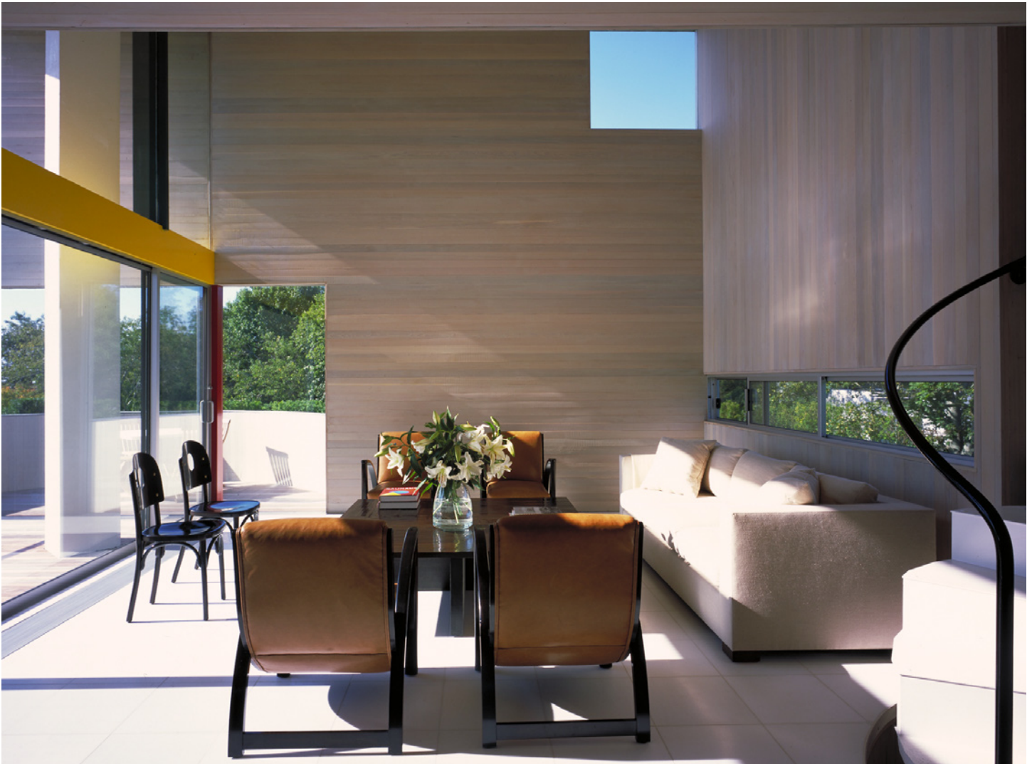
Living and deck from dining