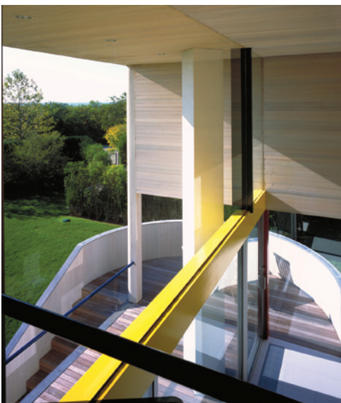
View from studio/sleeping balcony