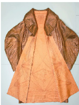
The Lohengrin Coat, 1931

The stitching and mattrassing used complex geometric motifs perfectly aligned and gives solidity like an abstract sculpture.