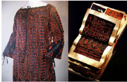
Winter Dress, 1920-21

This dress is made of black silk taffetas, embroidered with coral pearls and coral silk thread, with the lining in black silk mousseline. The geometric patterns resemble an traditional folklorique motifs from Eastern Europe.