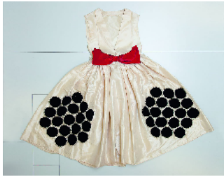
The Colombine Dress, 1924

The large skirting is inspired by the XVIII Century French « Bergeries » (French Shepherd Style).