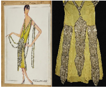
The Thousand and one Night Evening, Gown, 1925

The pattern evoke a stylised Japanese, enlarged circular motif of Mon . This circular coat of arms pattern is recurrent in Jeanne Lanvin's work. The shade of the Taffetas is reminiscent of porcelain, and Japanese lacquered reds and blacks.