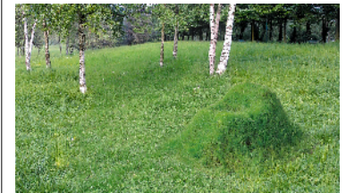
Terral armchair, Nucleo, 2000