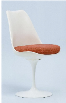
Tulip Chair, Eero Saarinen, 1956