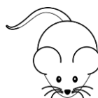
mouse / mice