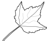
leaf / leaves