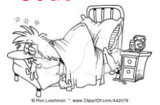
(to) lie down