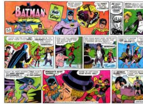
a comic strip