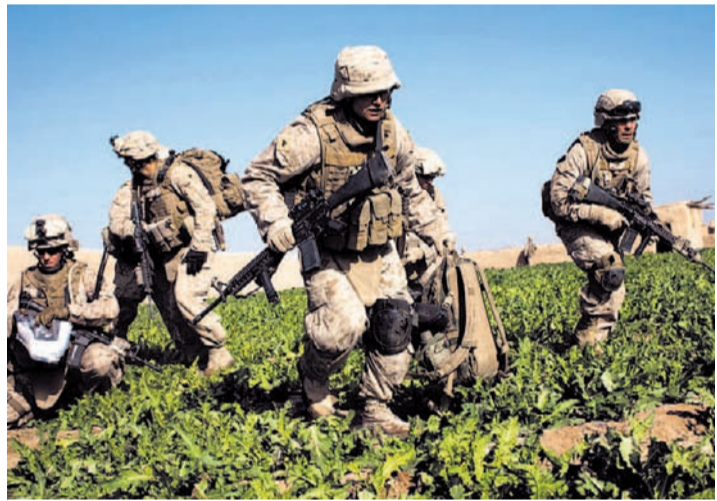
AMERICAN MARINES IN AN OPIUM POPPY FIELD IN MARJA, AFGHANISTAN, LAST MONTH. THE MILITARY DECIDED NOT TO DESTROY THE FIELDS.