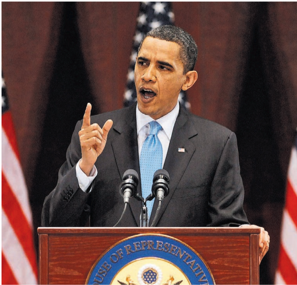
PRESIDENT OBAMA, SATURDAY, ON CAPITOL HILL: "WE'RE A DAY AWAY. AFTER A YEAR OF DEBATE, AFTER EVERY ARGUMENT HAS BEEN MADE, BY JUST ABOUT EVERYBODY, WE'RE 24 HOURS AWAY."