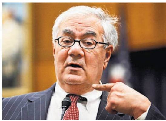
BARNEY FRANK, JAN. 21, ON PRESIDENT OBAMA: "He was very passionate about it, and he convinced me that we could put some fixes in."