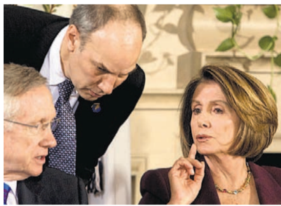
NANCY PELOSI, JAN. 28 "We will go through the gate. If the gate is closed, we will go over the fence. If the fence is too high, we will pole vault in. If that doesn't work, we will parachute in. But we are going to get health care reform passed."