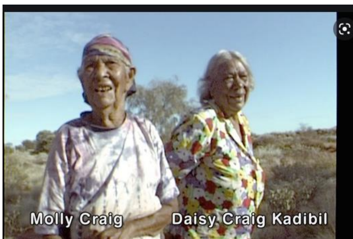
Molly and Daisy at the end of the film.