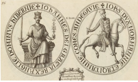
Magna Carta 800 years old Law Liberty Legacy