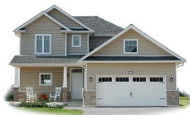
H ou se