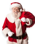
F ath er Christmas