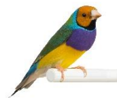
B ir d