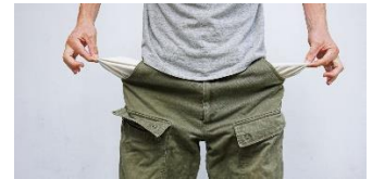
P oo r