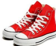
Sh oe s