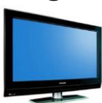
Telev is ion