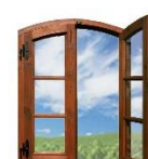
W in dow