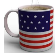
M u g