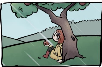
Milly sat under an apple tree.