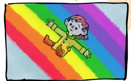
Milly was sucked up by the rainbow.