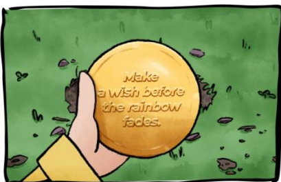
It was a golden coin.