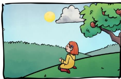
The rainbow disappeared, and so did her golden coin.