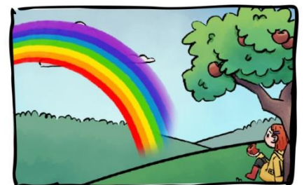
She saw a rainbow.