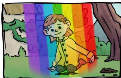
She landed back in her own garden.