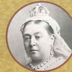
VICTORIA (1819-1901) Reigned: 1837-1901

The United Kingdom is a constitutional monarchy: the monarch is the Head of State, but Parliament makes the laws.