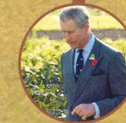
Charles, Prince of Wales (b. 1948)