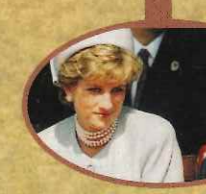
Prince Henry of Wales (b. 1984)