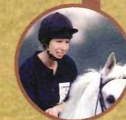
Anne, Princess Royal (b. 1950)