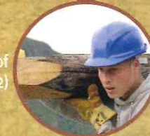
Prince William of Wales (b. 1982)