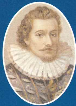
The Protestant King James I reigned from 1603 to 1625.

On Bonfire night, people remember the gunpowder plot, a secret plan to overthrow the King of England.