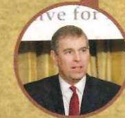
Andrew, Duke of York (b. 1960)