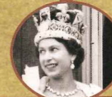
QUEEN ELIZABETH II (b. 1926) Reigned: 1952-present