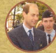
Edward, Earl of Essex (b. 1964)